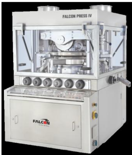
High Speed Tablet Press 4