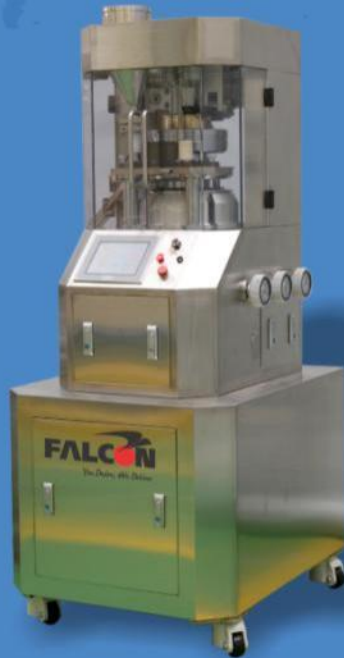
TABLE TOP SQUARE GMP SINGLE ROTARY TABLET PRESS MACHINE 8 Stn. 'D', 10 Stn. 'B' 12 Stn. Multi Tooling (4 D + 4 B + 4 BB)