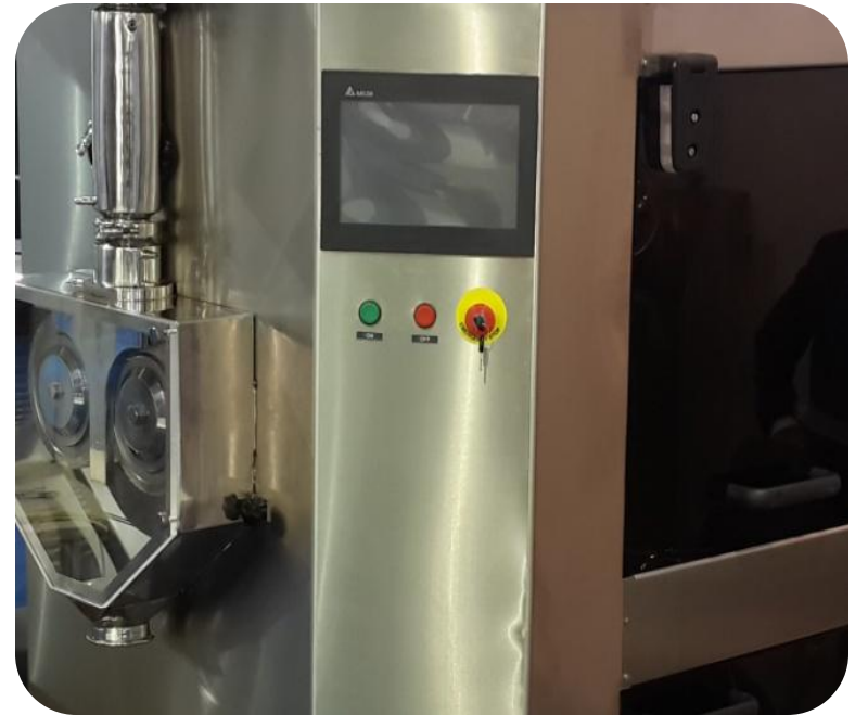
BEAST I –(PLC WITH HMI)