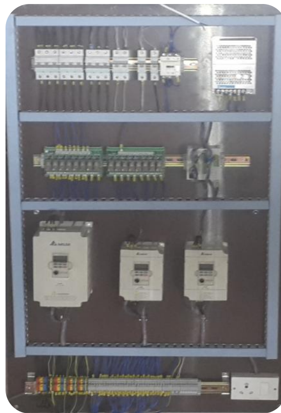
DETACHABLE BACK SIDE ELECTRIC PANEL