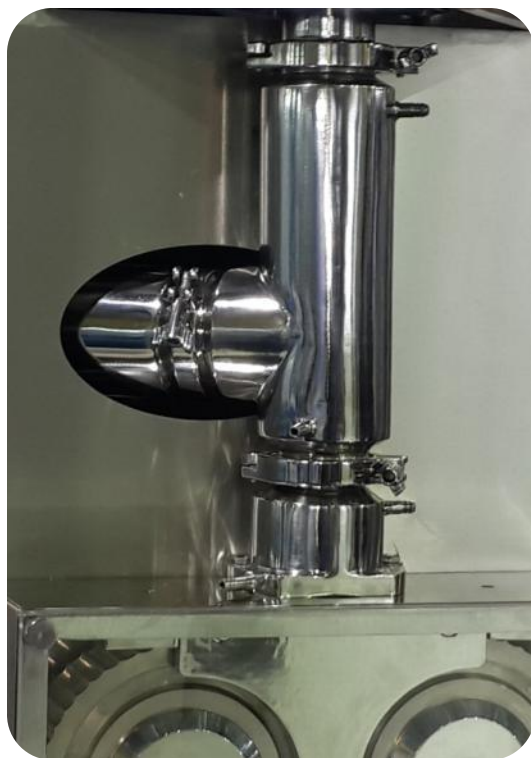
TWIN SHAFT FEEDER SCREW