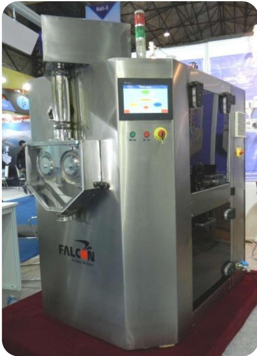
BEAST - I