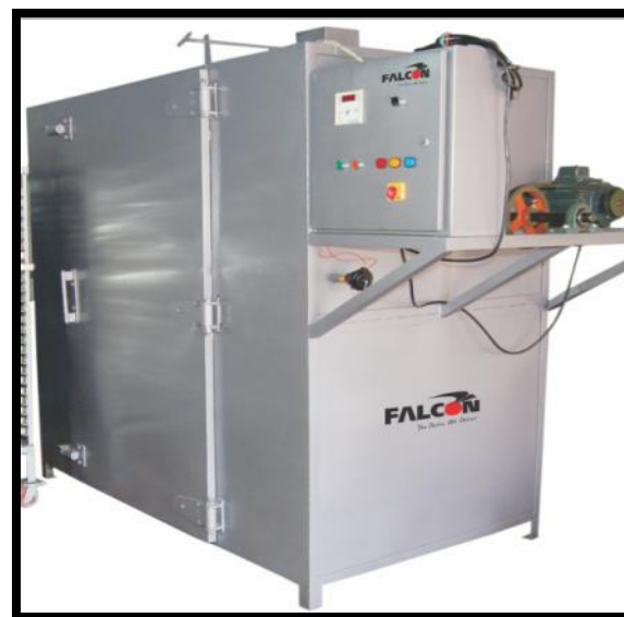
Tray Dryer Machine